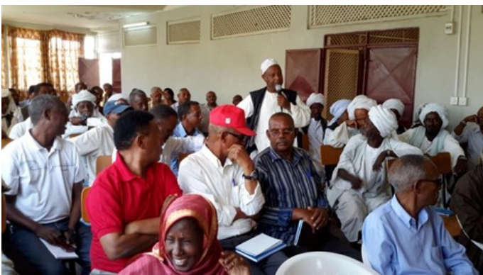
Local stakeholders at a meeting to discuss project implementation

Vita has been working in Eritrea since 2000 and has implemented various projects in the country. We recently commenced water pump repair work in a third region of Eritrea, Anseba.