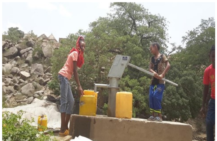
A rehabilitated hand pump

The programme, once completed, will supply clean water to approximately 140,000 people across Eritrea and contribute to overall carbon emission reduction of 300,000 tonnes per annum under the Vita Green Impact Fund.