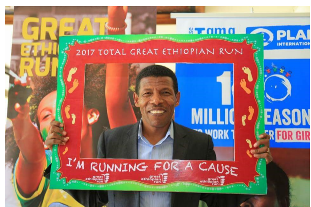
Haile Gebrselassie during the launch of the 2017 Great Ethiopian Run