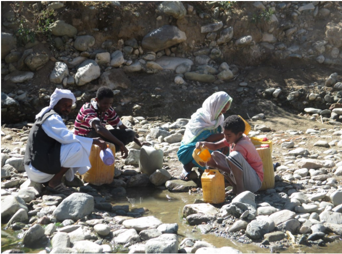
Families in Anseba before their well was fixed

The programme, once completed, will supply clean water to approximately 140,000 people across Eritrea and contribute to overall carbon emission reduction of 300,000 tonnes per annum under the Vita Green Impact Fund.