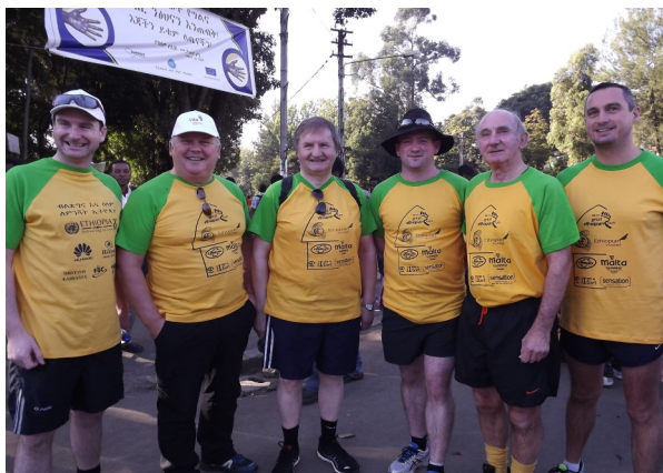
The Vita Team during a previous GER