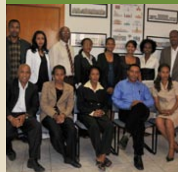
Vita Eritrea Team