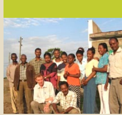
Vita Ethiopia Team