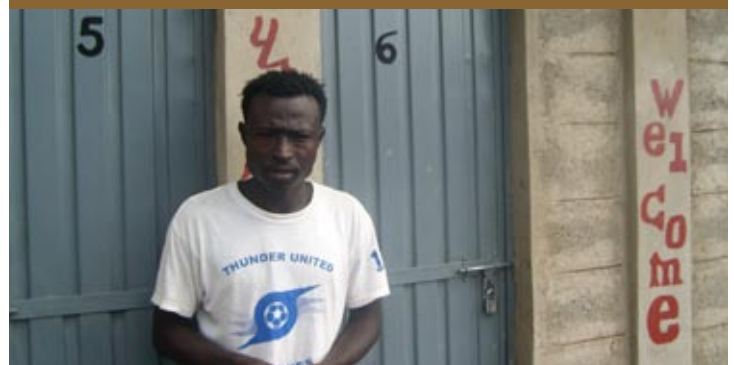
One of the Shower Group members standing outside the showers in Arba Minch

This project has helped each member have a stable income, helping them to lead their lives and plan for the future.