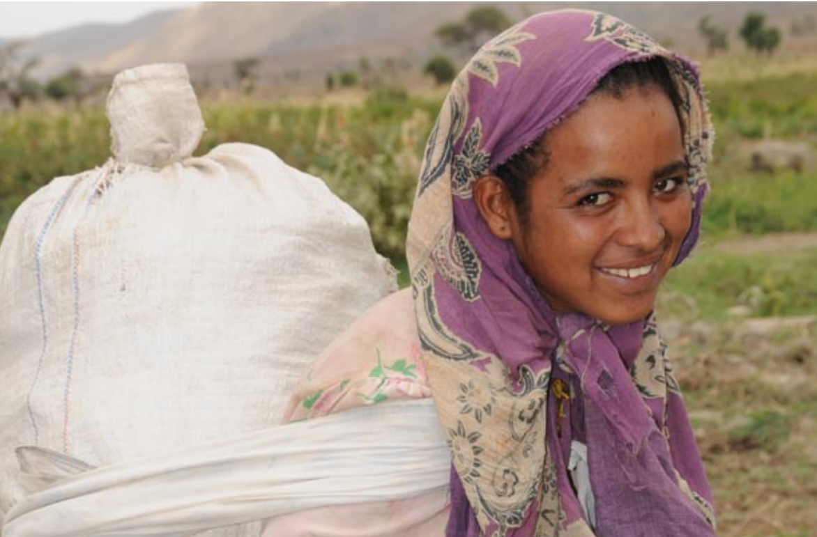
An Eritrean Women returning home from a co-operative with her bundle of vegetables.