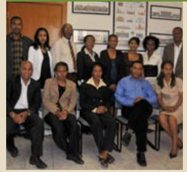
Vita Eritrea Team