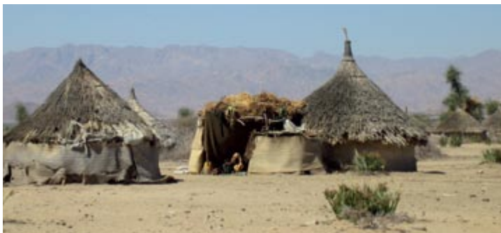
Eritrea Degraded land caused by climate change in Hagaz region.

As part of our commitment to help tackle Climate Change in Africa, Vita has developed a new 3 Step Action Plan for people who care about this issue and want to do something meaningful about it right now.