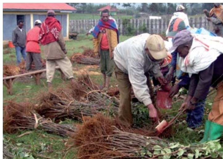
Apple and vegetable seedling distribution in Shama.