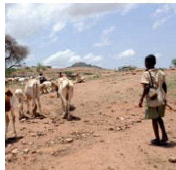
Ethiopia Children searching for grazing land.