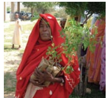
Trees A local Eritrean woman receives Moringa Trees at a Vita seedling distribution meeting.