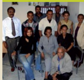
Vita Ethiopia Team