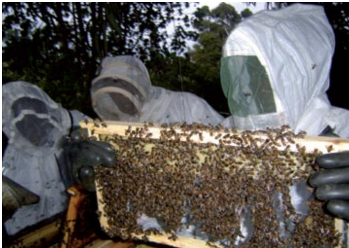
Beekeeping in action.

She is an elderly woman, she is one of the hardest working farmers on the project and she has therefore improved her quality of life with the income from the drip irrigation project. She has dedicated all her time and effort since 2008 and says “because of this project I am able to cover all my daily expenses like coffee and my daily meal - otherwise I may go hungry. May God bless those who helped us to reach into this stage.”